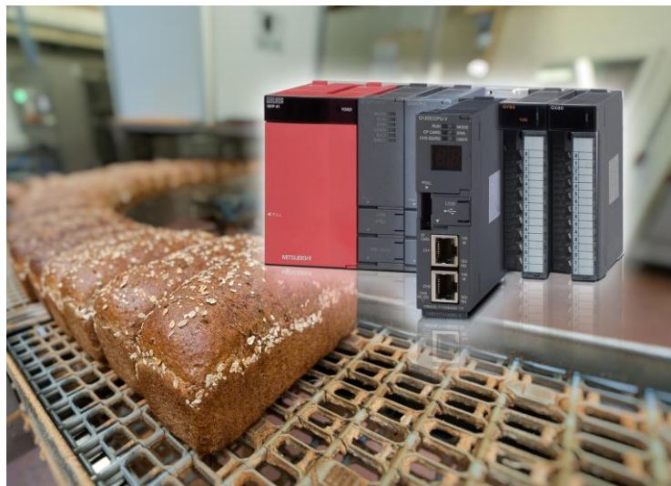
Mitsubishi Electric's PLC dedicated for different industrial sectors

Then there is the increased bus speed and the ability to synchronise multiple I/O in a high speed system, delivering a much more responsive control system. Again, this is much more difficult to achieve outside of the PLC environment.