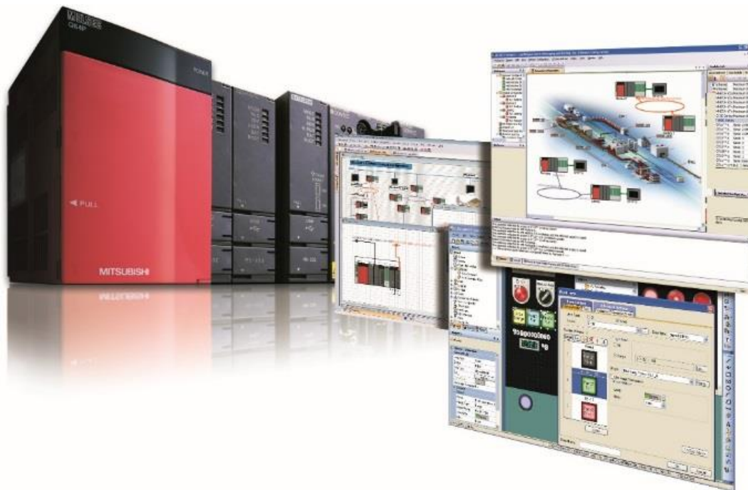
GX-Works – a clear and intuitive software for PLC

The biggest selling PLCs by volume covering the largest spread of applications are those offering 40 I/O or less. In such applications, the PLC represents a highly affordable solution, much more so than an equivalent PC-based system. However, the same essential platform is also scalable to tens of thousands of I/O, with users able to port control programs to bigger PLCs, benefit from the same programming environment and take advantage of completely modular hardware. The customization potential of the PLC is enormous, with numerous ways to expand the functionality but all without ever leaving a common platform.