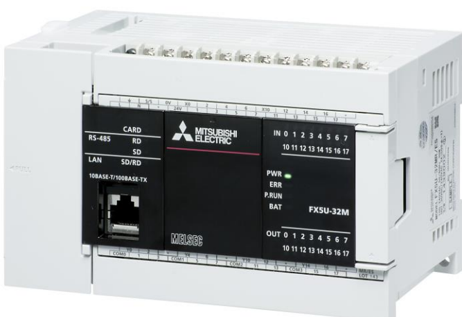
MELSEC iQ-F Series

be said for integration on a PC platform? Are the drivers for those third party modules guaranteed to work? How much configuration effort will be required? Perhaps more importantly, will there be the same assurance of ongoing compatibility through the operational lifespan of the control platform?